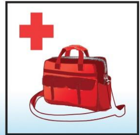
Medically Necessary and Diaper Bags*

*Medically Necessary & Diaper Bags must be properly inspected by Security Personnel at the entrance!