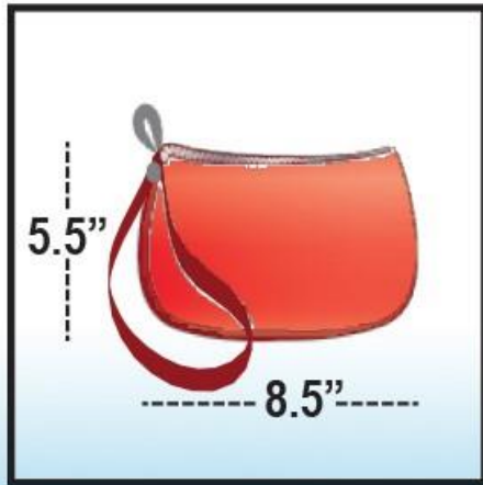
Bags smaller than 5.5"x 8.5"